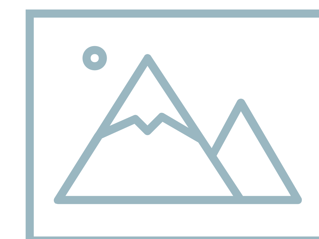
Image 1 Caption (18 pt)

Dui faucibus in ornare quam viverra orci sagittis eu. Pretium nibh ipsum consequat nisl.